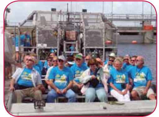
A group boards the fan boat to view alligators. We saw three of them, it was so cool.