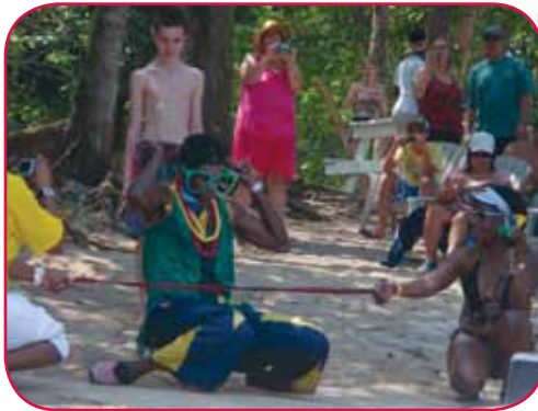
This is an entertainer who was part of the Dunns River Falls tour. He could limbo all the way under this limbo stick – it was amazing to watch!